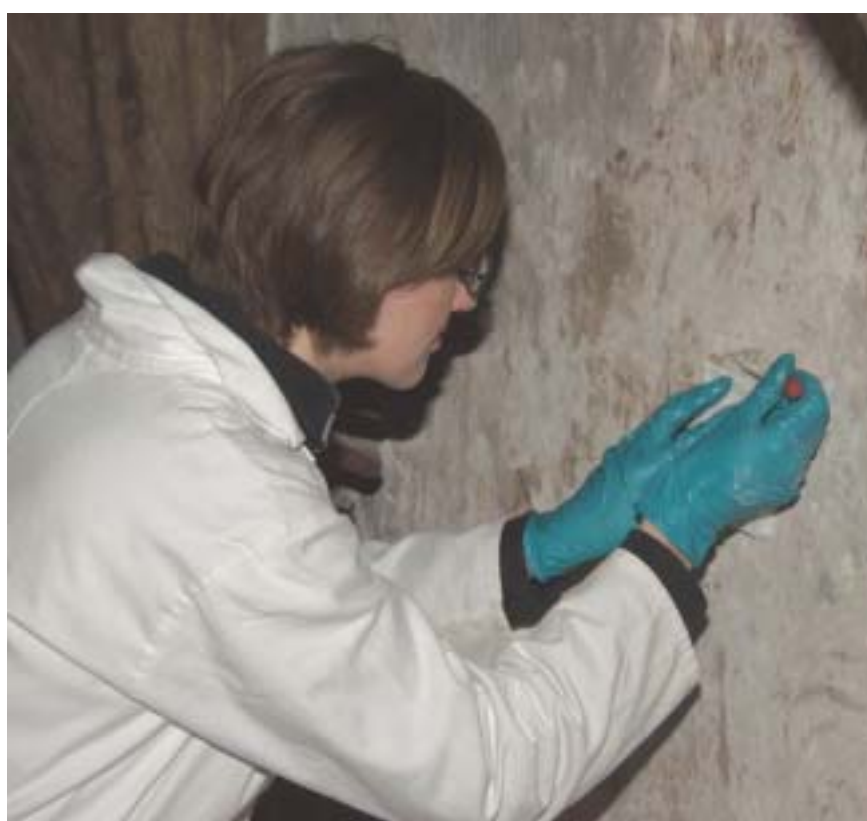
Conservator consolidating the paint layer