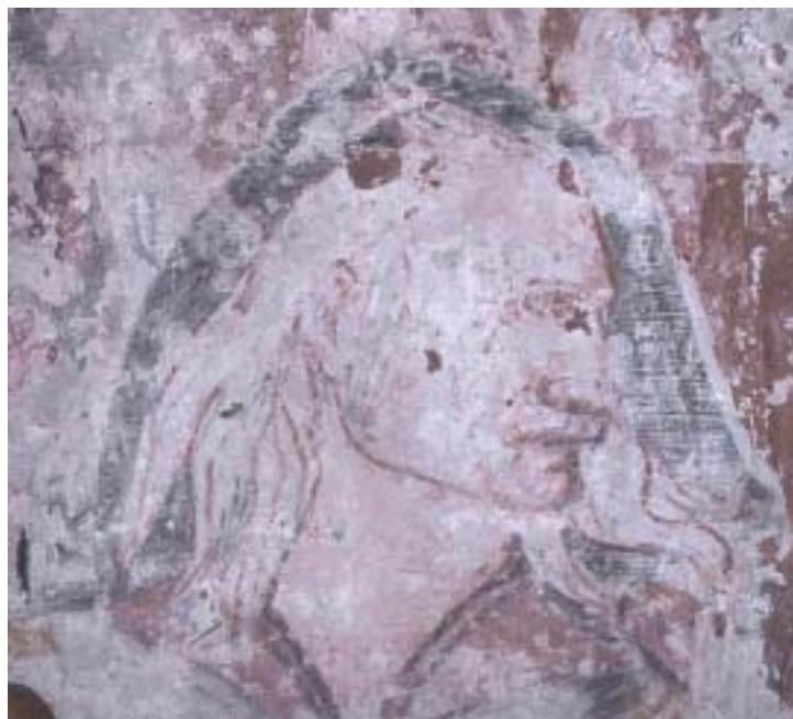
Head of St Simon on the north wall

A survey of the paintings undertaken in 1995 showed that the areas of the wall paintings which had been treated in the recent past were in a relatively good condition. A number of small areas of flaking were noted but such damage was very limited. However, the later paintings, towards the west end were far less stable and were likely to deteriorate further if left untreated.