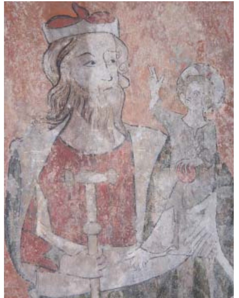
14th Century figure of St Christopher

The wall paintings and architectural polychromy in the church date from at least five different periods, from the 13 th to 17 th centuries. The earliest paintings are the masonry pattern and figures of saints in the small windows in the south aisle. Next come the paintings of St Christopher and St George on the north wall of the nave, which appear to be mid 14 th century in date. The Doom, the Visitation, the Annunciation and the coats of arms which cover the east end of the nave all date to the early 15 th century. Following the reformation, the figurative paintings were covered with biblical texts, some of which can be seen on the nave walls towards the west. More significant are the large figures of the Apostles and Cardinal Virtues, which date to the early 17 th century. For further details, see Alan Fawcitt, The Wallpaintings of Willingham , Cambridge 1990, which is on sale by the south door of the nave.