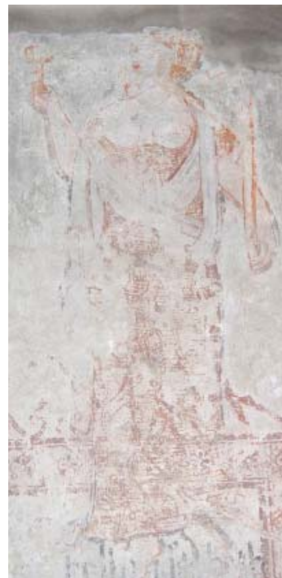
Figure of Faith on the south wall

Following a fund raising programme by members of the parish, and the award of a grant from the Heritage Lottery Fund, a programme of conservation is being undertaken on the remaining areas of wall paintings towards the west end of the nave. The aim of the work is to stabilise the wall paintings in order to prevent further deterioration and loss. In conjunction it is intended to reduce the level of accumulated surface dirt, so that the paintings can be more clearly seen and the subject matter made more accessible to the viewer.